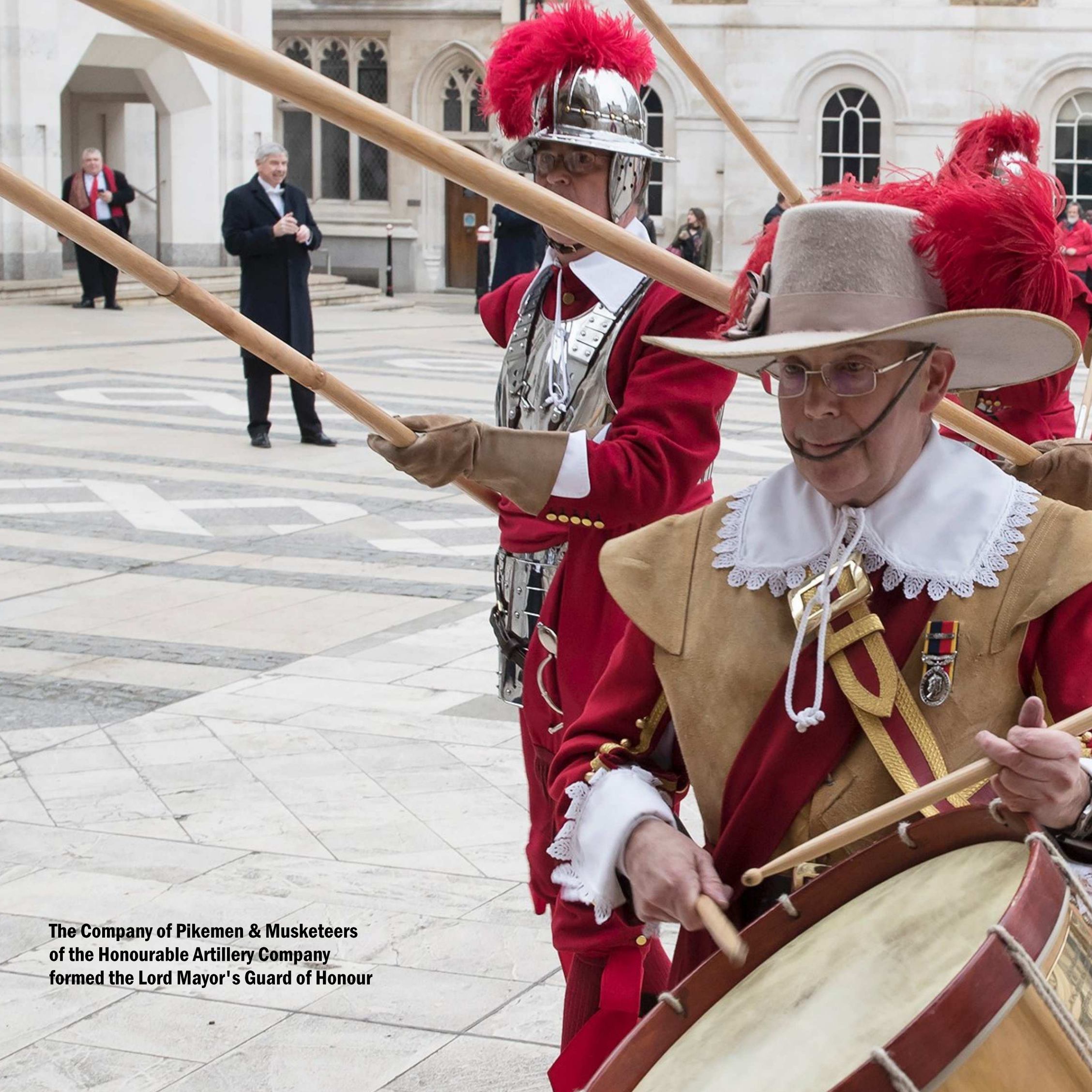
The Company of Pikemen & Musketeers of the Honourable Artillery Company formed the Lord Mayor's Guard of Honour